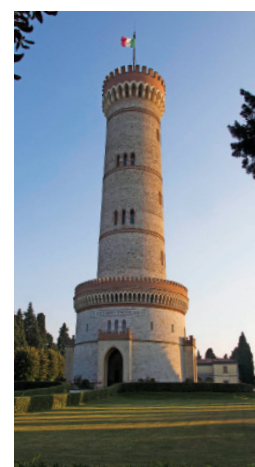
Above and left: the monumental tower of San Martino della Battaglia, and the view of Lugana's vineyards from the top