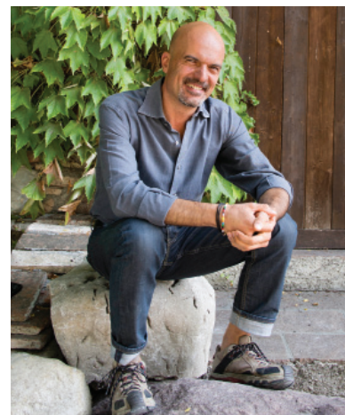
Left: the harvest gets underway