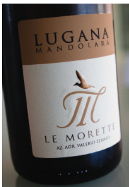
Above: the classic T-shape Turbiana grape on the vine. Left: a bottle from Le Morette, the winery that acts as Lugana's primary vine nursery